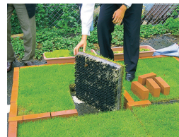
"Easy attachment and renovation" and "the long-term vegetation"

Eco Green Mat is easily able to attach (in 2 days, shortest) and renovate with because it's lightweight compared with the planting using the soil and its thickness is also about one-fifth. Its "durable period" is 12 years (actual 16 years in 2014 time) and longer compared to the normal soil so it can also be a "reduction of costs in introduction and maintenance."