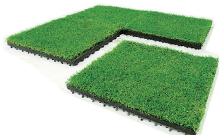
"Eco Green Mat"

Performing a rooftop greening grass in natural soil weights about 160kg / m 2 . By the Building Standards Act, a reinforcement work is necessary. On the other hand, Eco Green Mat of 39kg / m 2 is can be attached to existing buildings.