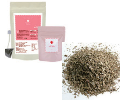
"Product Name: Juju Guava Tea"

A delighted customer's voice: Cured "constipation in a week."